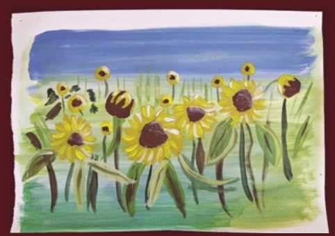
Sunflowers - acrylic