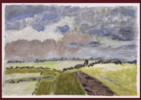
Copy of a landscape - acrylic