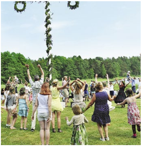
Dancing around the Maypole.