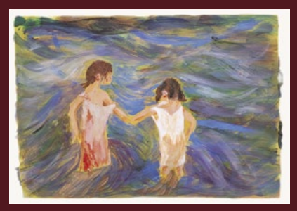
Children in a stream. Copy of a painting - acrylic.