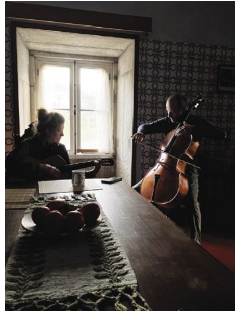
Danish couple who entertained them - this picture looks like an Old Master!