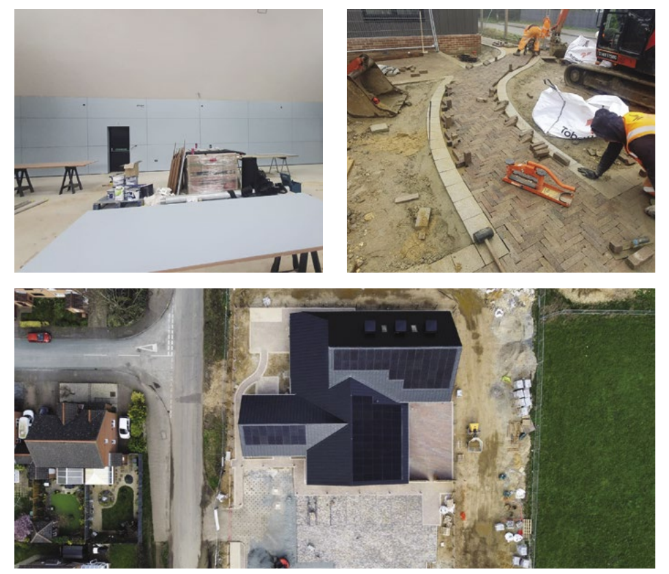
Interior and exterior work progressing on the new community centre.