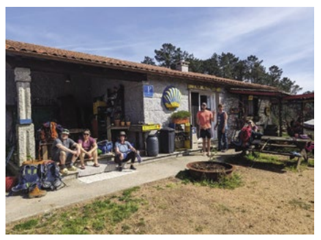
One of the hostels they stayed at.

of the good weather. The continuous rain made the paths muddy and difficult to navigate but we soldiered on meeting fellow pilgrims and sharing experiences along the way. The local people we met on the road were friendly and helpful, pointing out shortcuts and offering us fresh oranges from their trees. Each afternoon it was a great