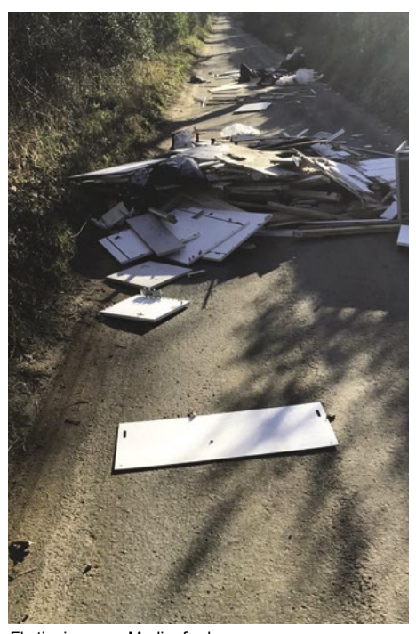
Fly tipping near Marlingford.

forms.southnorfolkandbroadland. gov.uk/councilforms/ Neighbourhood/FlyTipping/ LocationDetails