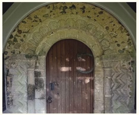
The Norman archway.

38 years later, this ancient building is still used by the community for regular worship, marriages, baptisms, funerals and prayer and meditation. It is kept unlocked. It's known that there was a Saxon church here, then the Normans added an arch around the main door and the font, just inside. Restoration and additions continued. The tower was built during the 13th century. We have recently had an architect's inspection and report which lists areas for repair and maintenance –