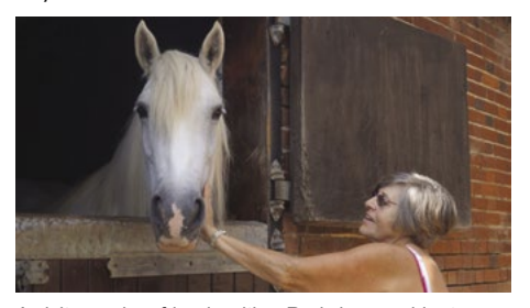
A visitor makes friends with a Redwings resident.

Redwings Horse Sanctuary, the UK's largest horse welfare charity founded in 1984, is celebrating its Ruby Anniversary this year. Since its formation, more than 5,500 rescued horses, ponies and donkeys have found safety in the Sanctuary as well as countless others who have been helped in their homes through the outreach work of Redwings' field officers and welfare team. Currently the charity is responsible for over 2,000 horses and donkeys, including more than 700 rehomed to loving Guardian homes. Its headquarters remains in Norfolk, with nationwide sanctuary sites in Essex. Warwickshire. Monmouthshire and Forfar in Scotland. Redwings is planning a year of events to mark the