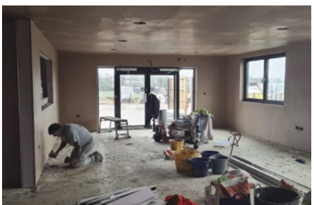
Work is progressing on the interior and exterior areas of Easton's new community centre.