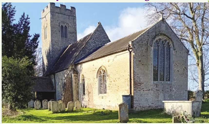
St Mary's, Marlingford.

There are a few ancient buildings in our communities which have stood the test of time and could tell many fascinating stories if their walls could speak! Particularly, I'm thinking of our three lovely churches -St Andrew's, St Peter's and St Mary's, Marlingford which have stood watching over our villages for several hundred years. But it's only with the help of local residents donations and other special grants that they have not fallen into disrepair. They are still lively, community