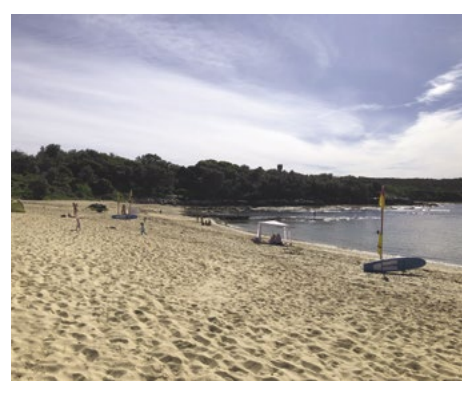
The beach at Malabar.

Ted, were going to visit my first grandson, born in late November. As on previous visits, we stayed in a comfortable apartment overlooking the sea in the village of Malabar, just south of Sydney. The view was spectacular and the golden beach was just 10 minutes' walk away.