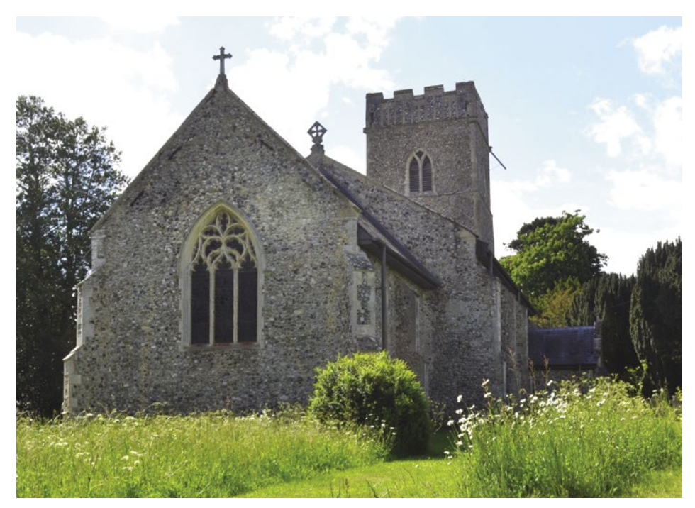
St Andrew's Church, Colton.