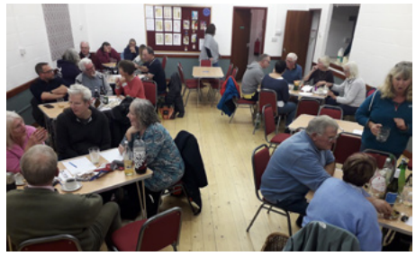
Colton quizzers take a well-earned break

Colton's annual quiz night was well attended in spite of horrendous weather resulting in roads and verges steeped in mud around Colton, and the rugby world cup semi-final being played the same night! Quizzers answered questions on a variety of subjects including audio clips on old westerns which had them reaching far back into the memory banks! The aptly named Mudlarks were the victors on this occasion but it was a close thing with other teams not far behind. The evening raised £104.35 for the village hall fund.