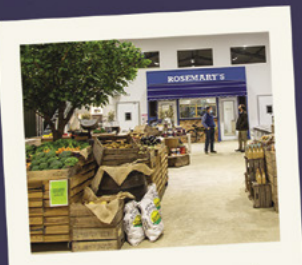
Browsed the Farm Shop