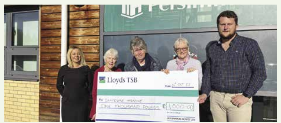
The Grapevine committee members receiving the Community Charity award cheque from Persimmon Homes