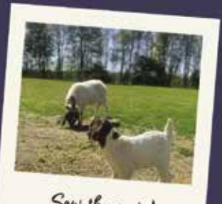
Saw the goals!