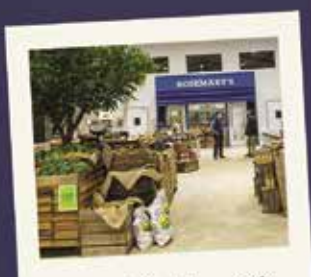
Browsed the Farm Shop