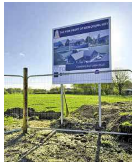
Site of community centre

Easton parish councillors are pleased to confirm work has now started on the new community centre. A temporary entrance has been created and the main work should start on site in January 2023.