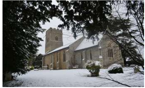
A snowy scene at St Andrews, Colton, 2013.

The entitlement dates back to the Enclosure Act of 1801, when residents lost the right to collect fuel from the Common Land. A piece of land, identified as The Poor Land, was set aside and rented out. The Trustees, who make annual return to the Charity Commissioners, agree an amount each year which is then distributed in cash to each household in Colton. The funds are divided out at the annual Christmas bingo which is run by the village hall committee. All villagers are welcome to attend and collect their money; many people then stay for a fun night of bingo and refreshments.