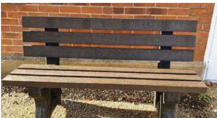
The bench at Marlingford village hall.