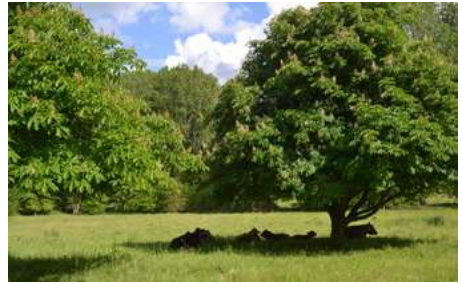
View across the meadow this summer.