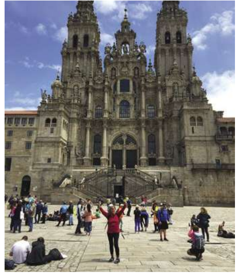
Triumphant at completing the pilgrimage!

After many more highs and lows, I triumphantly strode into Santiago de Compostela on July 1. At the pilgrim's office, I proudly received my Compostela, and finally, to crown it all, at the pilgrim's mass in the Cathedral that