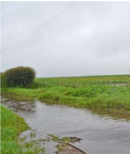
Flooded or impassable roads can be reported online.

Drainage and flooding: Standing water, ditches, blocked drain, flooded property, impassable road