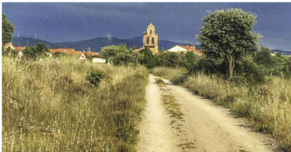
A tranquil scene along the way.

It was bliss. It had air conditioning! There were many local people there and I got chatting. Then I ordered a beer and then another one. Big mistake! When I ventured outside after spending an hour there, it was into a scorching heat of 38 degrees! I honestly thought I would collapse, have a heart attack or stroke, just walking those last few kilometres; that was also the day I got my first blisters!