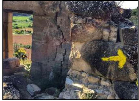
Arrows indicate the direction of travel.

Being Irish, I am not very tolerant of hot weather, certainly not walking in temperatures of over 30 degrees. So I started to get up before sunrise at 4:30am to start walking and would stop before noon, thereby avoiding the merciless heat of the hot midday sun. This was one of the most beautiful experiences of the whole Camino. It was wonderful to be walking as the light began to gently illuminate the darkness and grow increasingly more intense. It was so very peaceful. As screeching swallows swooped down over the glowing meadows practically fanning my face with their wings, I thought how lucky I was to experience this. At times like this, I felt happy to be alive, listening to the rhythmic click of my walking poles while butterflies emerged stretching their wings in the morning light and sleepy lizards and snakes found their positions to sunbathe for the day. It wasn't long though before fitter pilgrims would begin to pass me