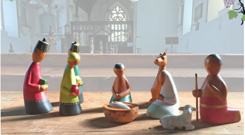
Posada figures in Colton church.