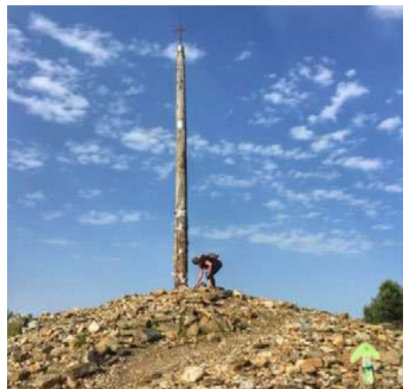
The Cruz de Ferro.

on the road calling out "Buen Camino" as they passed. The other advantage of an early start was that I usually arrived as the hostel was opening and so could bag a bottom bunk, have a shower, wash out my clothes and hang them out before the hostel would begin to fill up. The heatwave continued. One day, just three kilometres from Estella, my destination that day, I decided to stop for a coke – not usually a favourite drink of mine, but wonderfully refreshing in the heat. I went into a little local café.