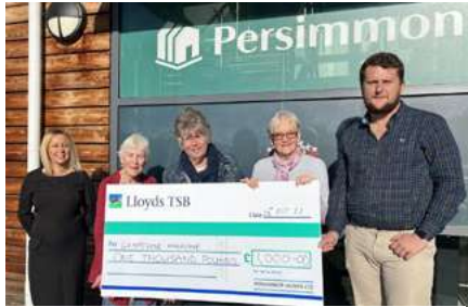
Cheque is presented to the Grapevine Committee.

We are thankful for the donation and recognition of our service to