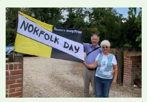
30 people came and £221 was raised to keep Marlingford Church in good repair.

They had baked Norfolk shortcakes, Norfolk stout cake, Norfolk vinegar cake, chocolate cake, scones and a creamy Victoria sponge was donated.