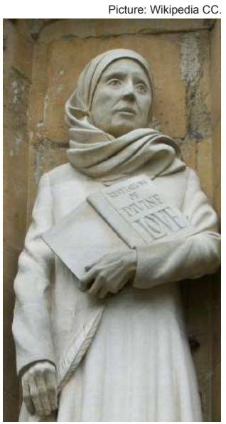
Julian of Norwich statue by

The seasons seem less defined, the wildlife less prevalent and the lives we live just a little more precarious perhaps. What are we doing to our