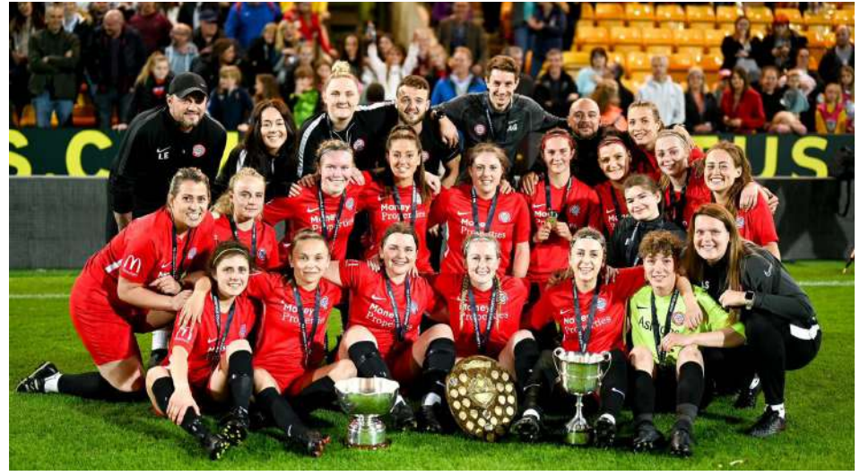
Wymondham Women clinch the Norfolk County Cup at Carrow Road in May.