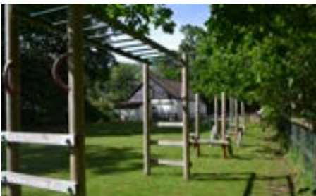
Colton amenity area

Work is ongoing to secure a new lease for the Colton amenity area . Regular grass cutting has recommenced at Colton amenity area and Marlingford conservation area and play area . This will continue into the early autumn. In the forthcoming months the