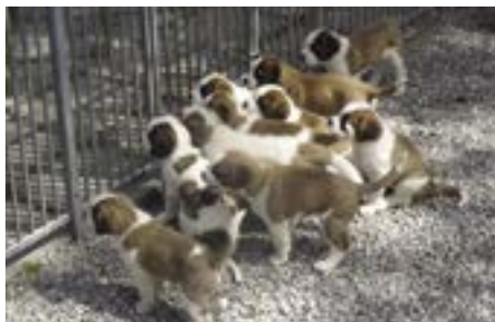
St Bernard puppies..

We took picnics on a very steep mountain walk alongside a channel taking natural water gradually to areas where the