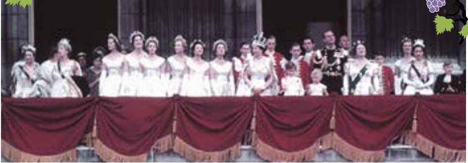
The Queen and the Royal family on the balcony of Buckingham Palace after the coronation in 1953.