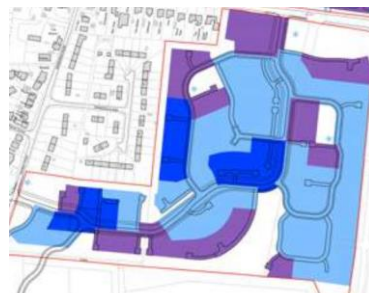
Design Code 2019